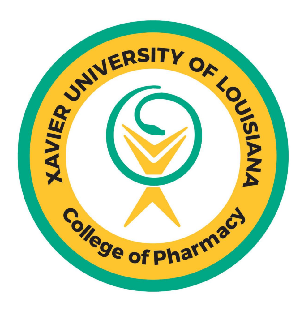
Academic & Ethical Policies Handbook 2019 – 2020