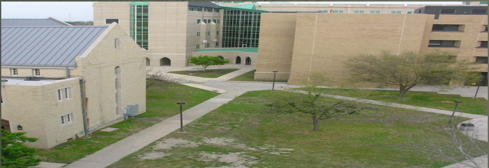
Music Building (Rear) March 2006