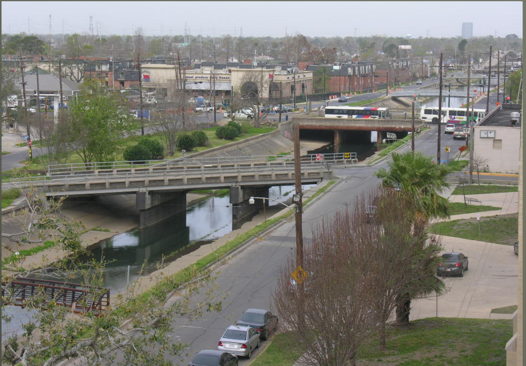
Washington Ave. Canal March 2006