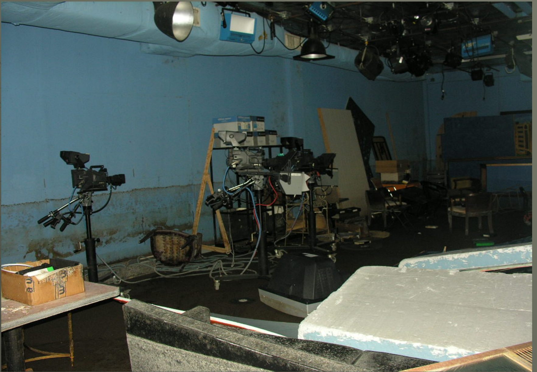
XUTV at Xavier South After Storm