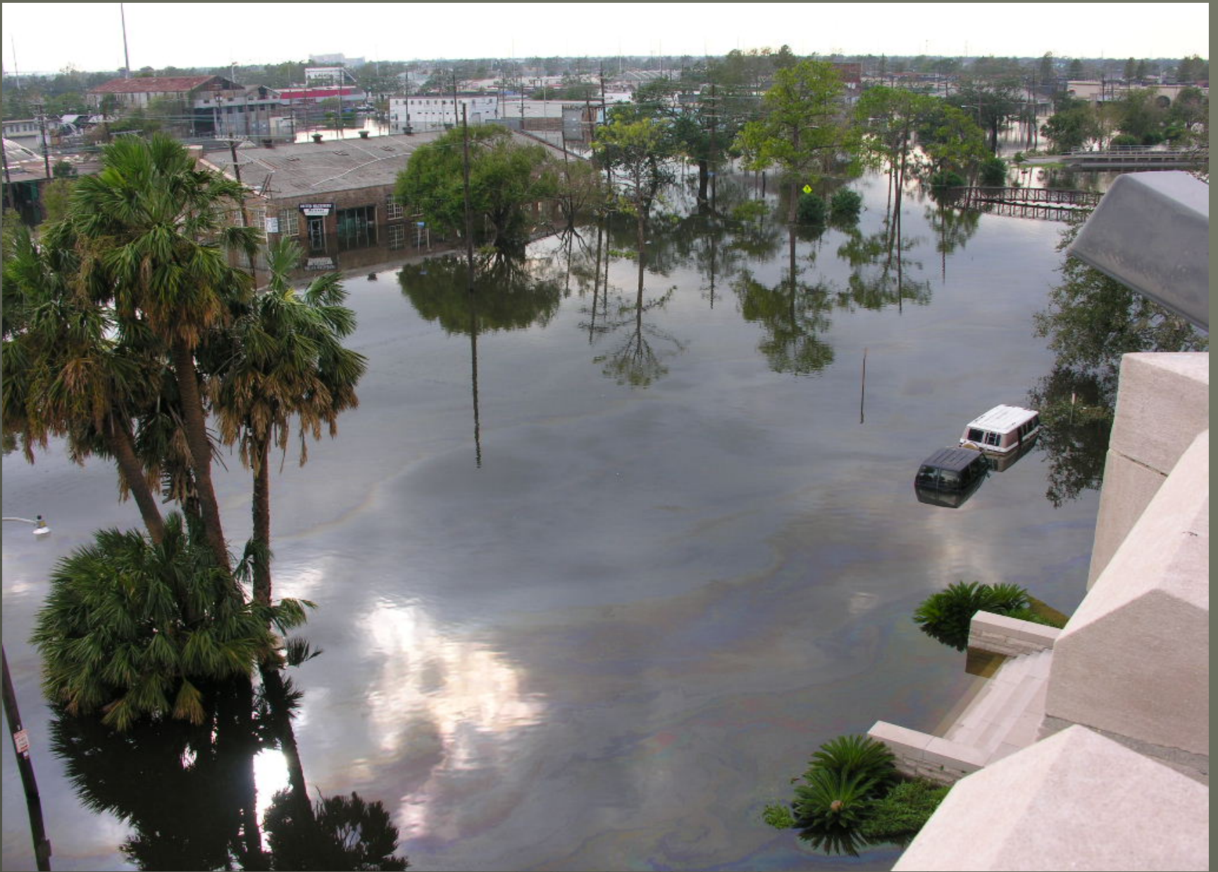
Washington Ave. Canal August 30, 2005