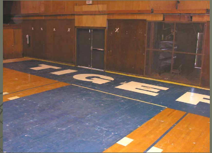
Gymnasium Floor on Loan From Jackson State University