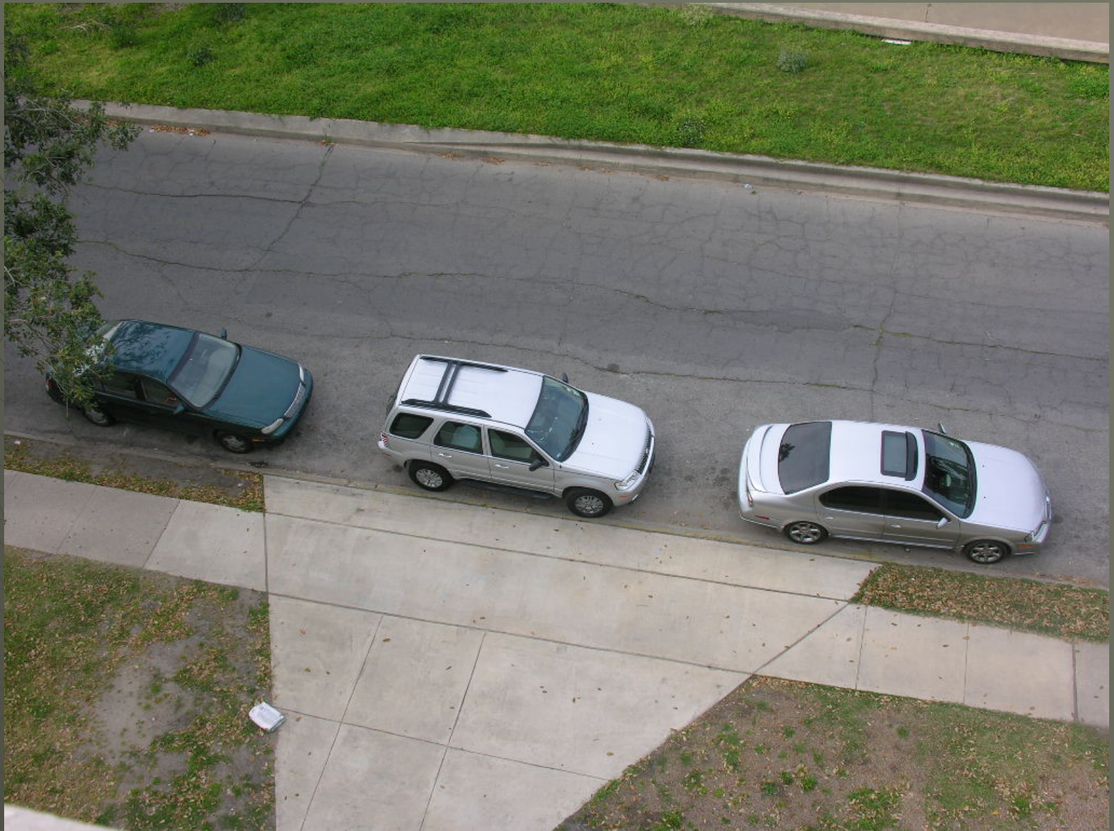
Administration Building (Front) March 2006