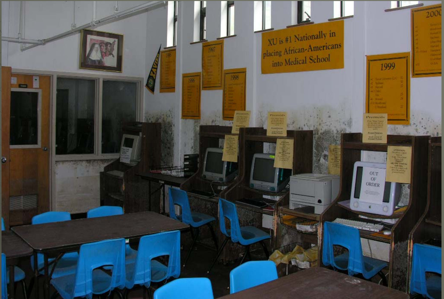
Pre-Med Resource Lab