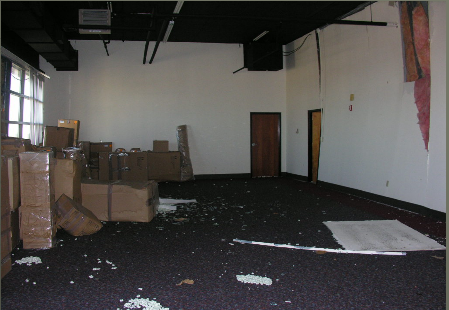
Nissan Room October 2005