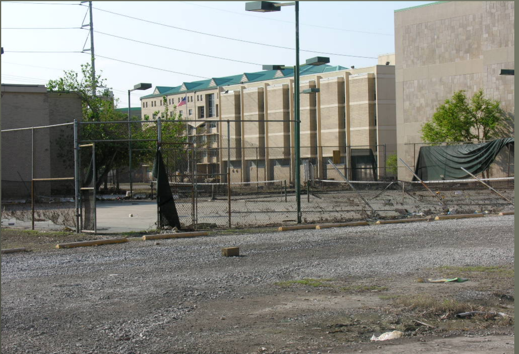
Tennis Courts October 2005