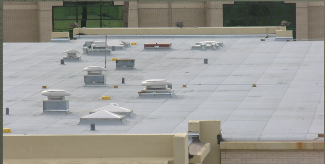
St. Joseph's Roof March 2006