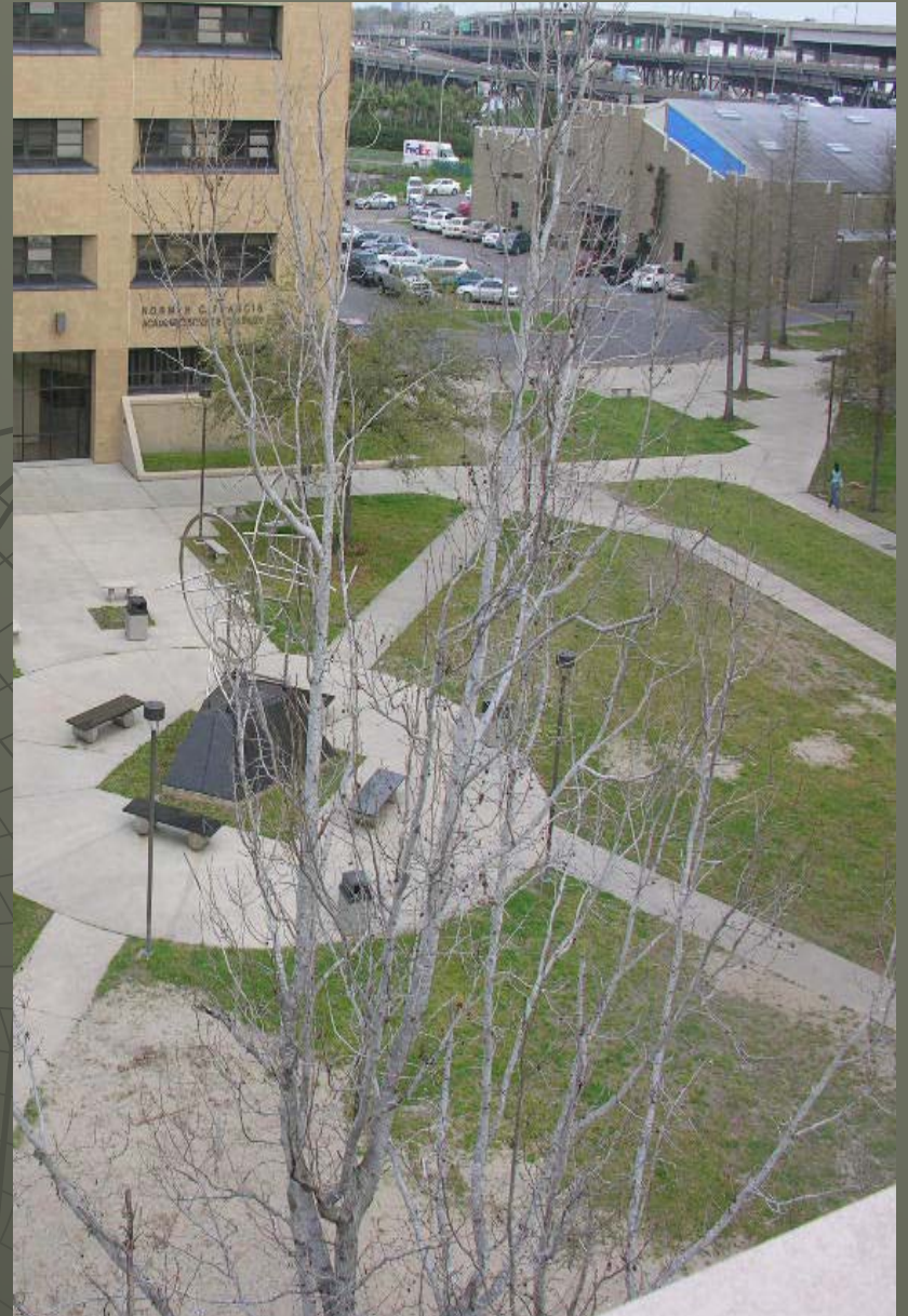
Science Quad March 2006