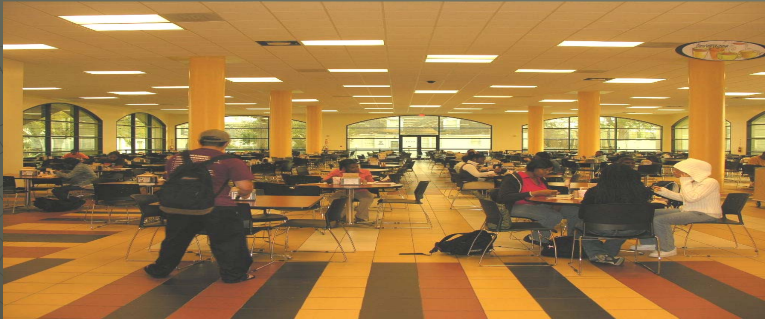
UC Café After Renovations