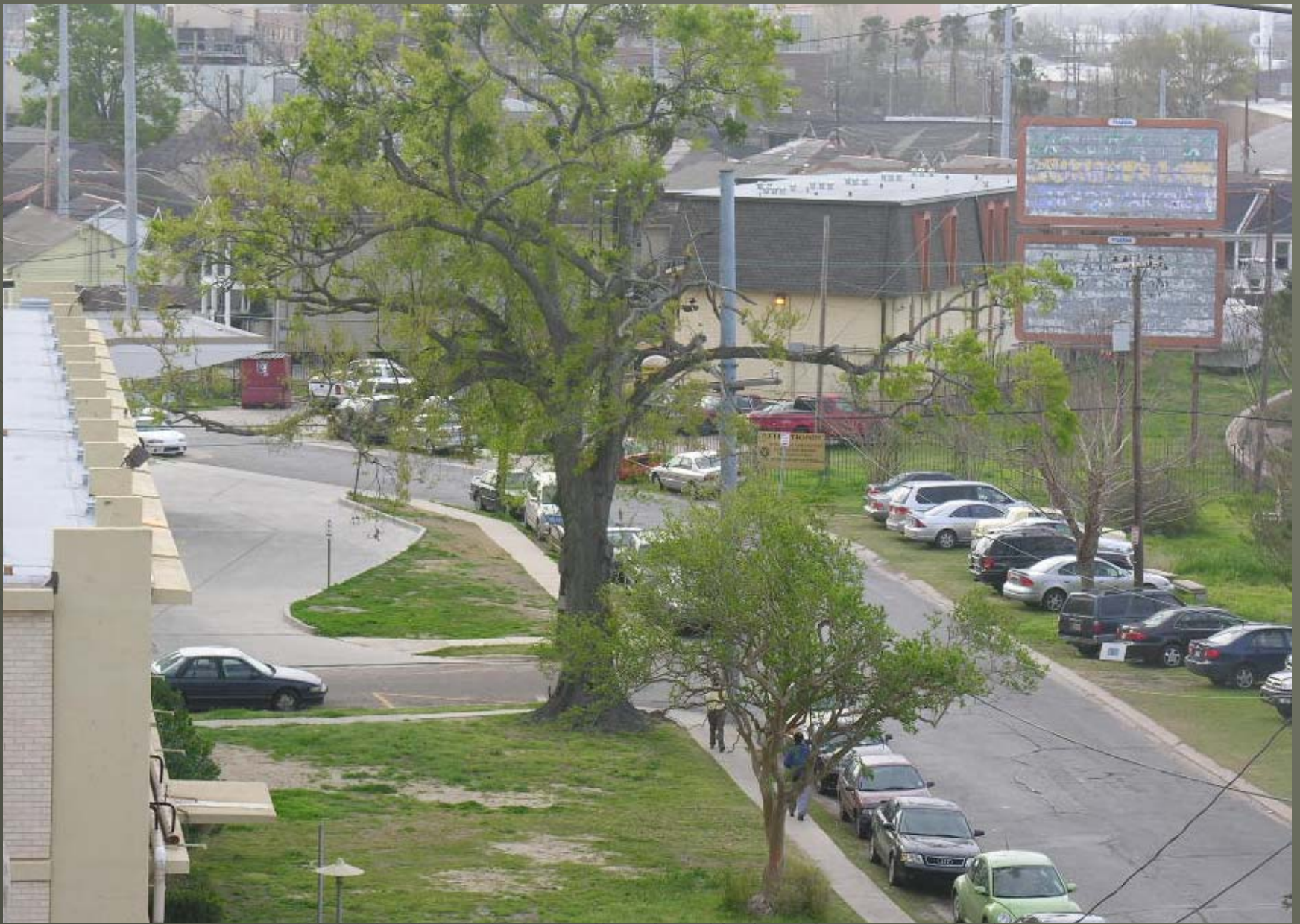
Drexel Dr. at St. Joseph's Dormitory (Front) March 2006