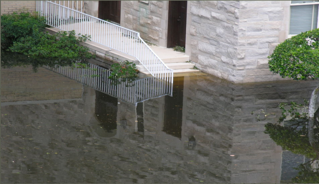
Convent Stairs (Rear) During Katrina