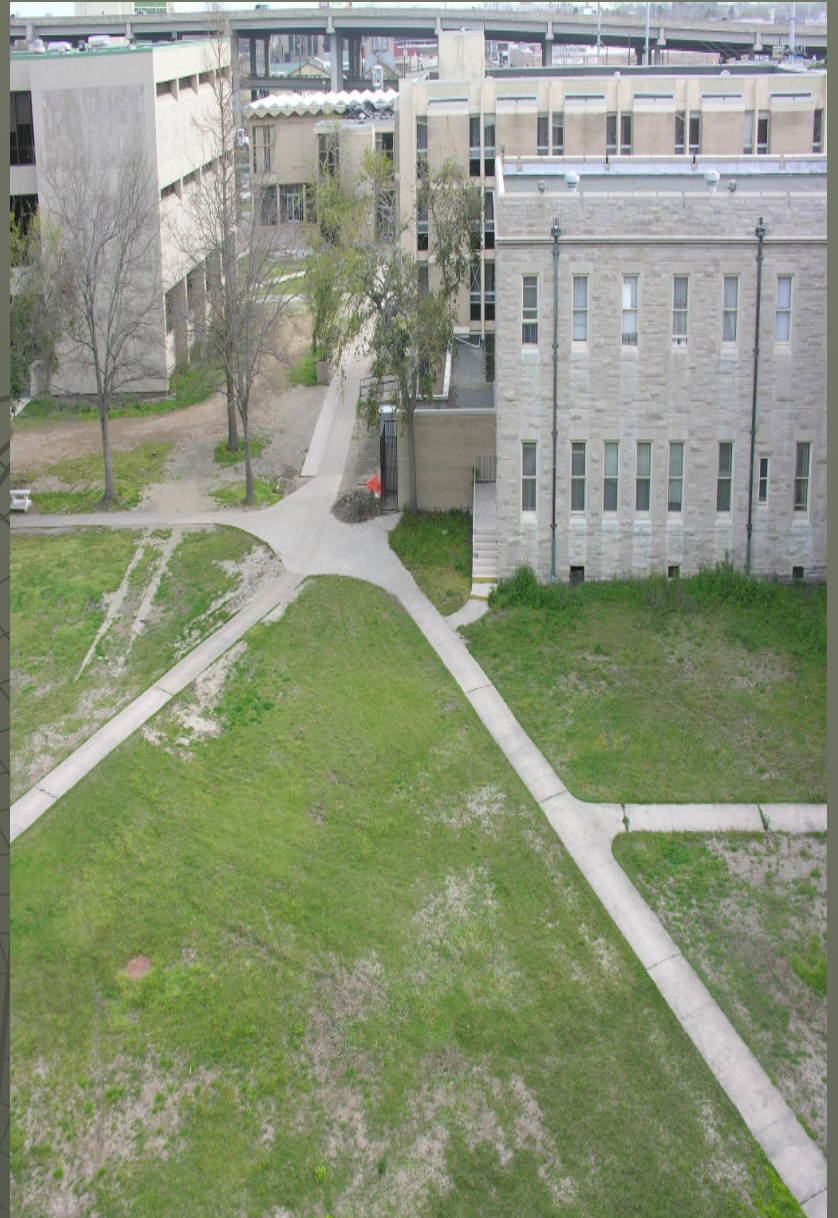
Quad March 2006