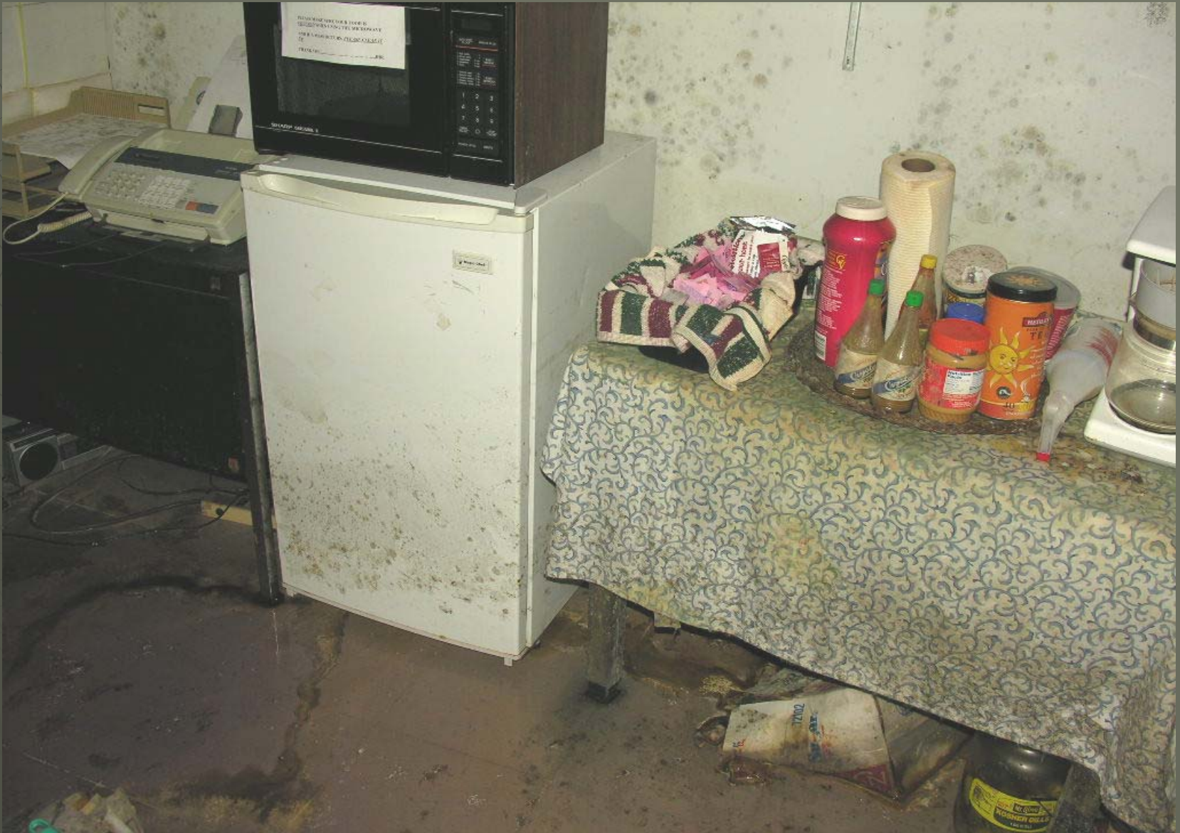
Xavier South Break Room