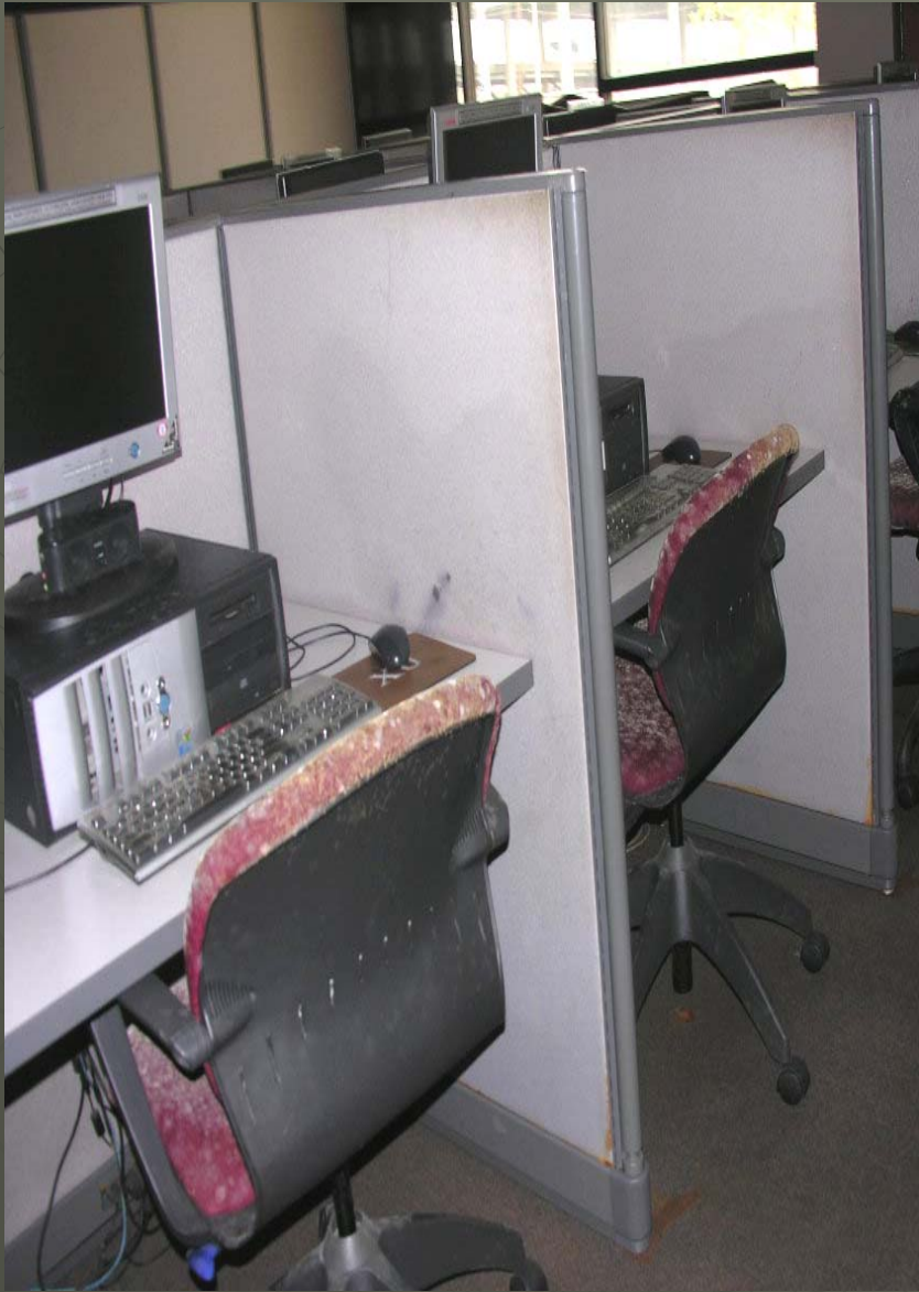
RMC Lab October 2005