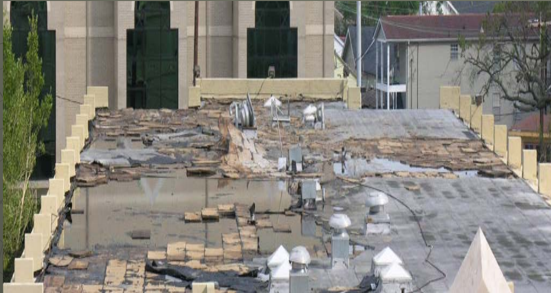
St. Joseph's Roof August 30, 2005