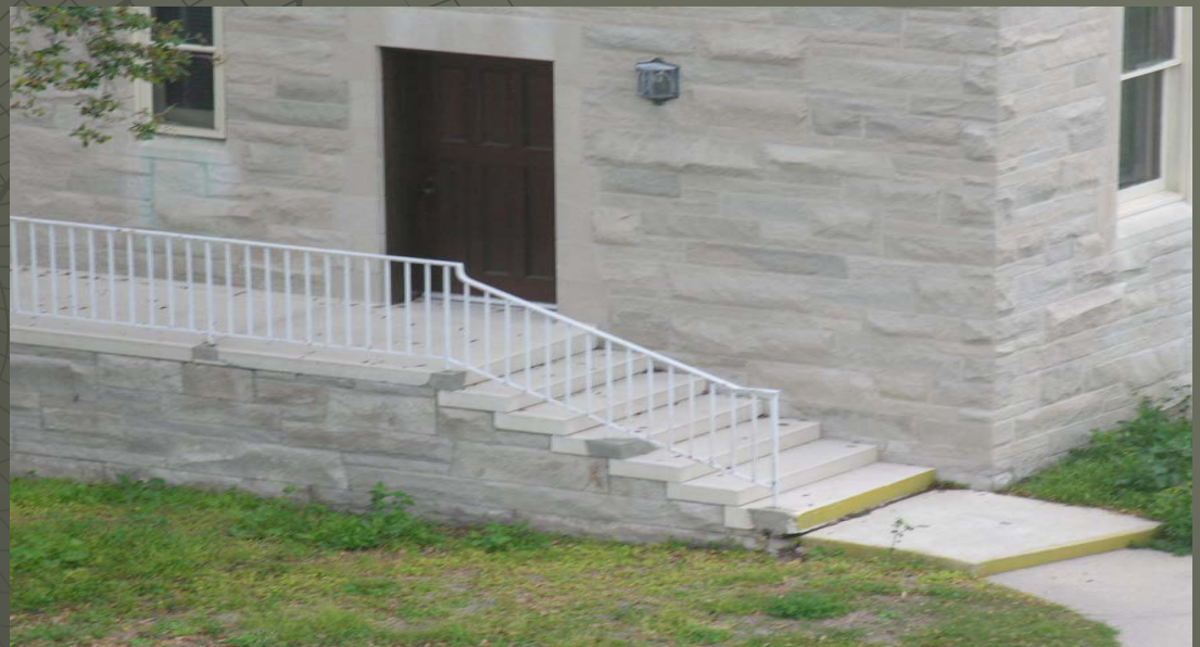
Convent Stairs (Rear) March 2006