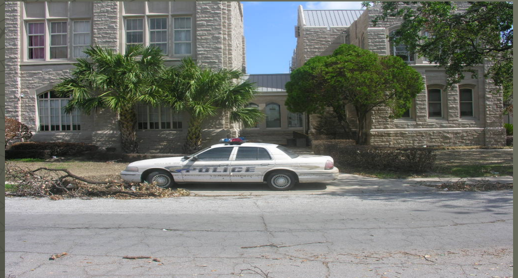
Police Cruiser Mid-September