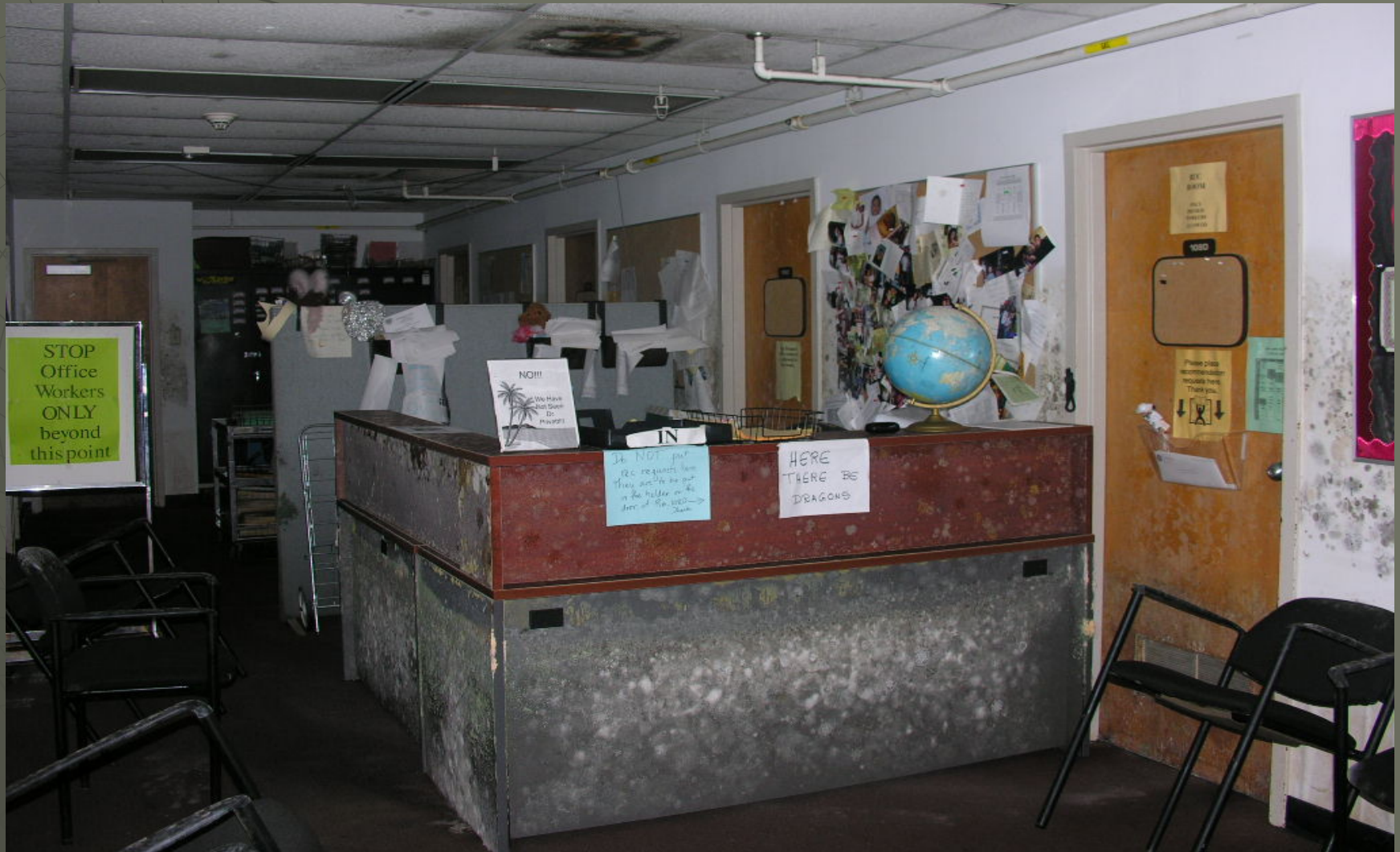
Pre-Med Office October 2005