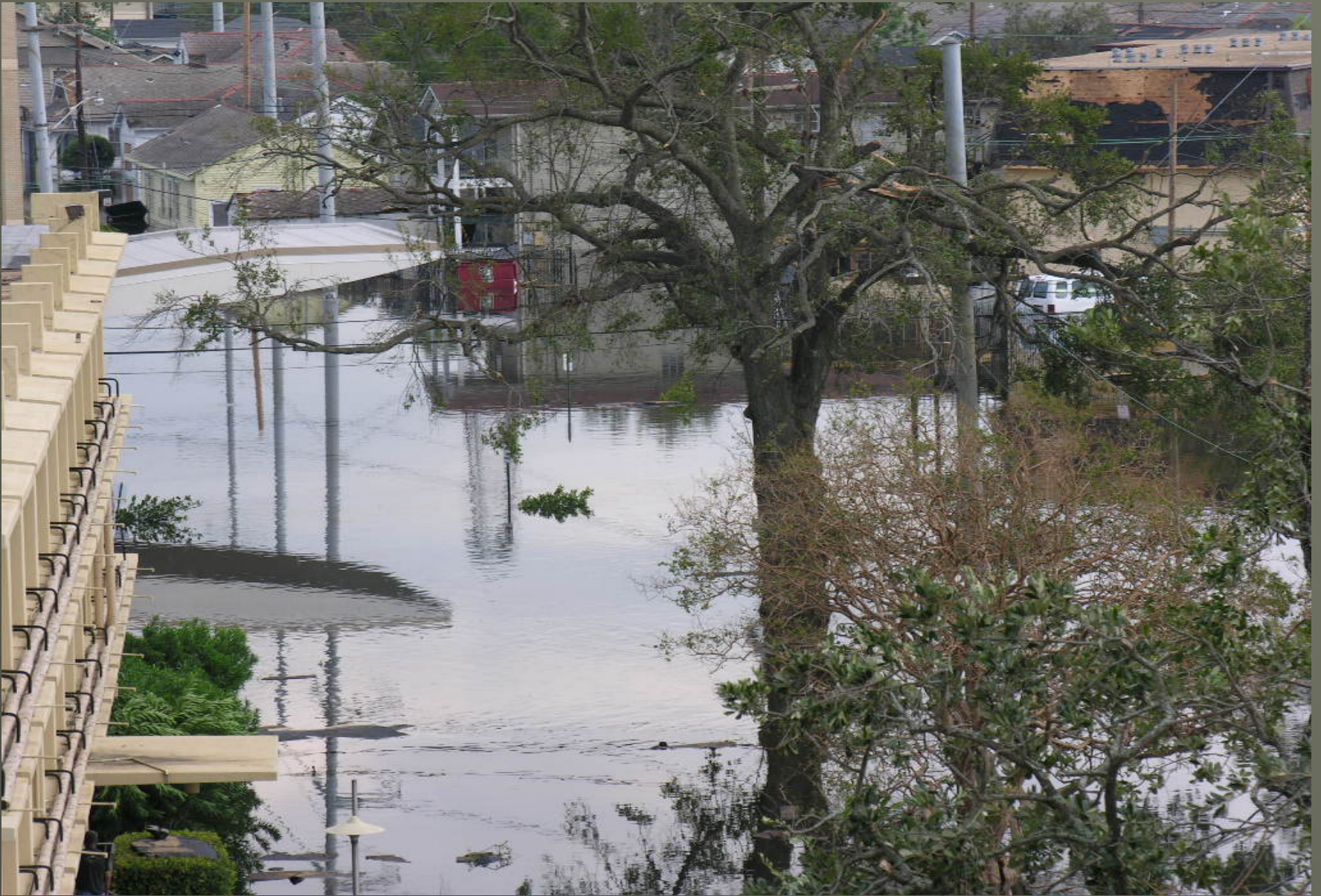
Drexel Dr. at St. Joseph's Dormitory (Front) During Katrina