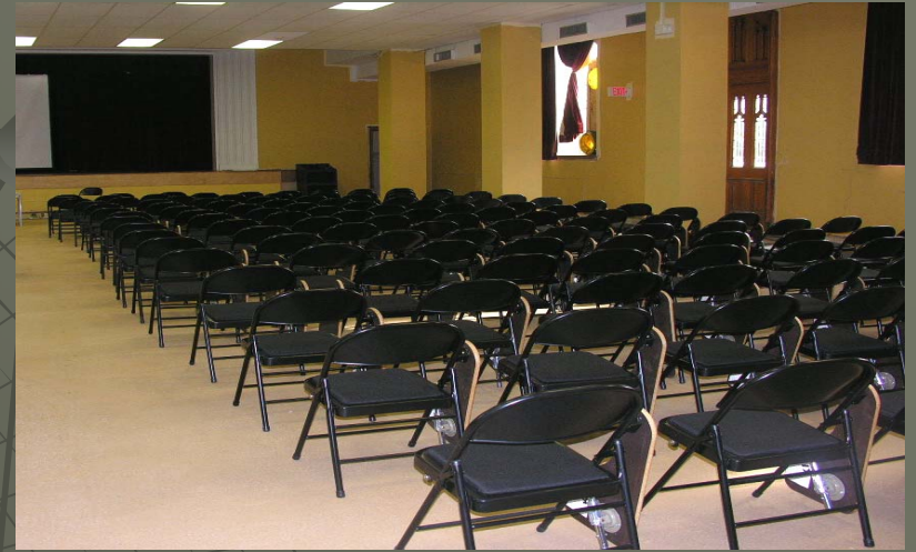
Administration Auditorium March 2006