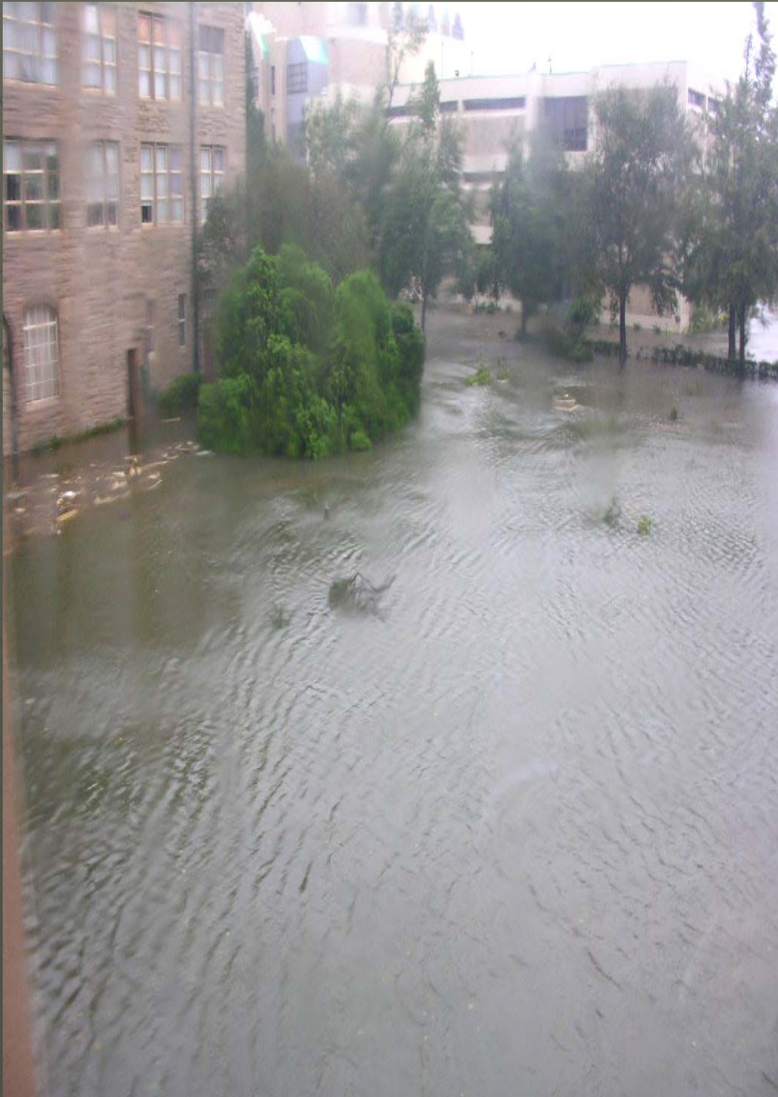
Quad During Storm