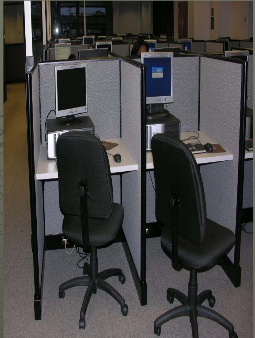
RMC Lab March 2006