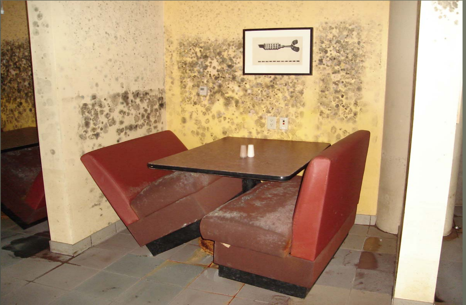
University Center October 2005