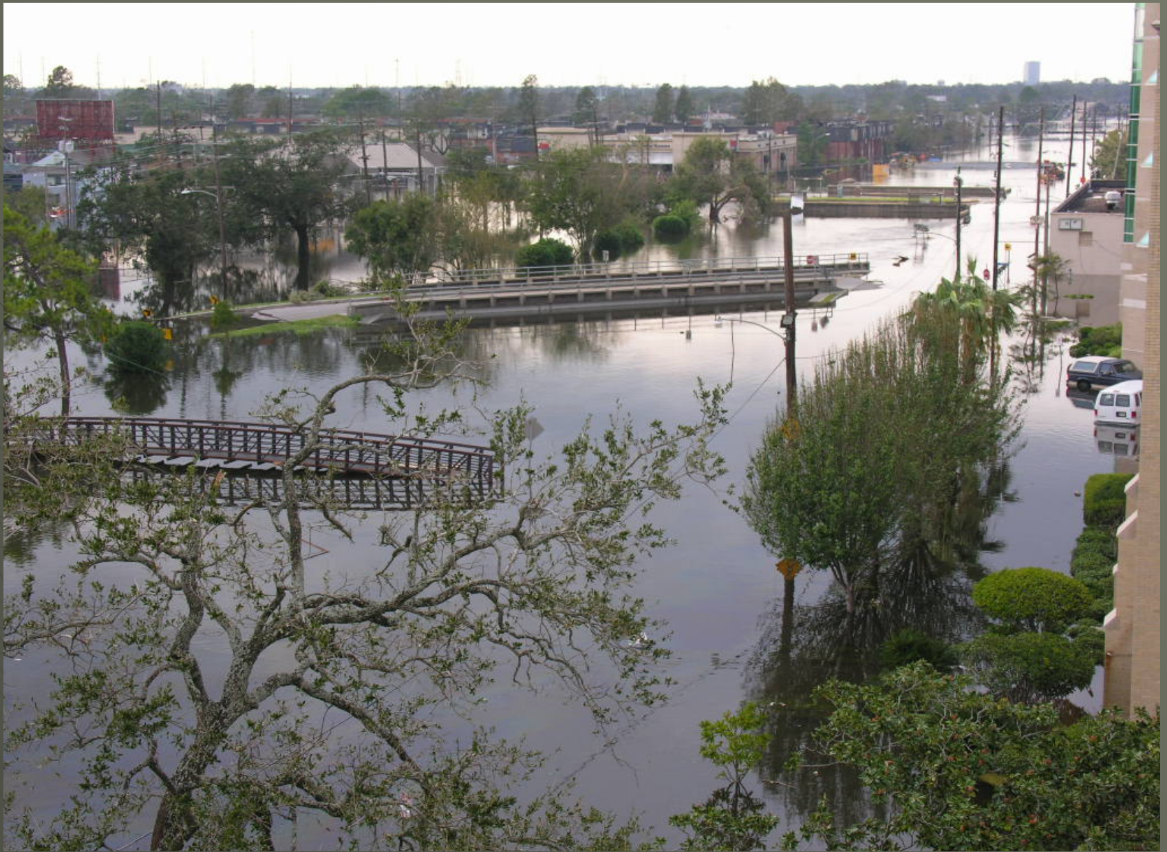
Washington Ave. Canal August 30, 2005