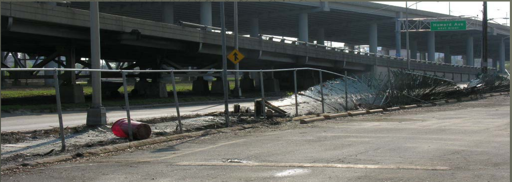
Fence Behind Pharmacy