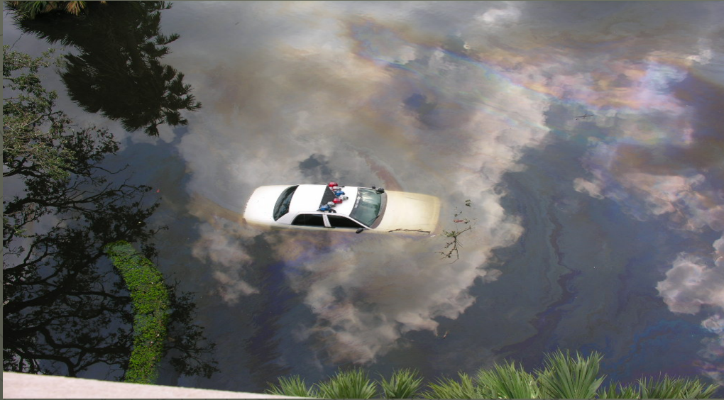
Police Cruiser Parked at Administration Building During Katrina