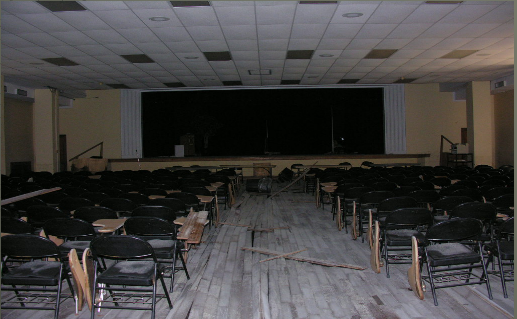
Administration Auditorium Mid-September