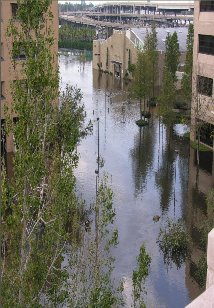
Science Quad During Katrina