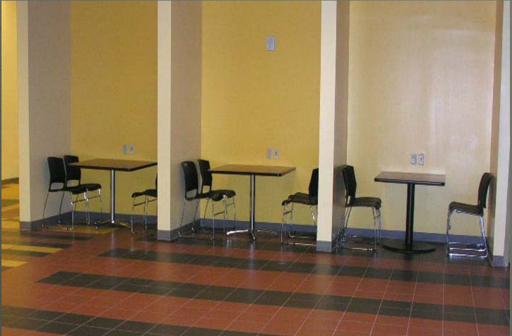
University Center March 2006