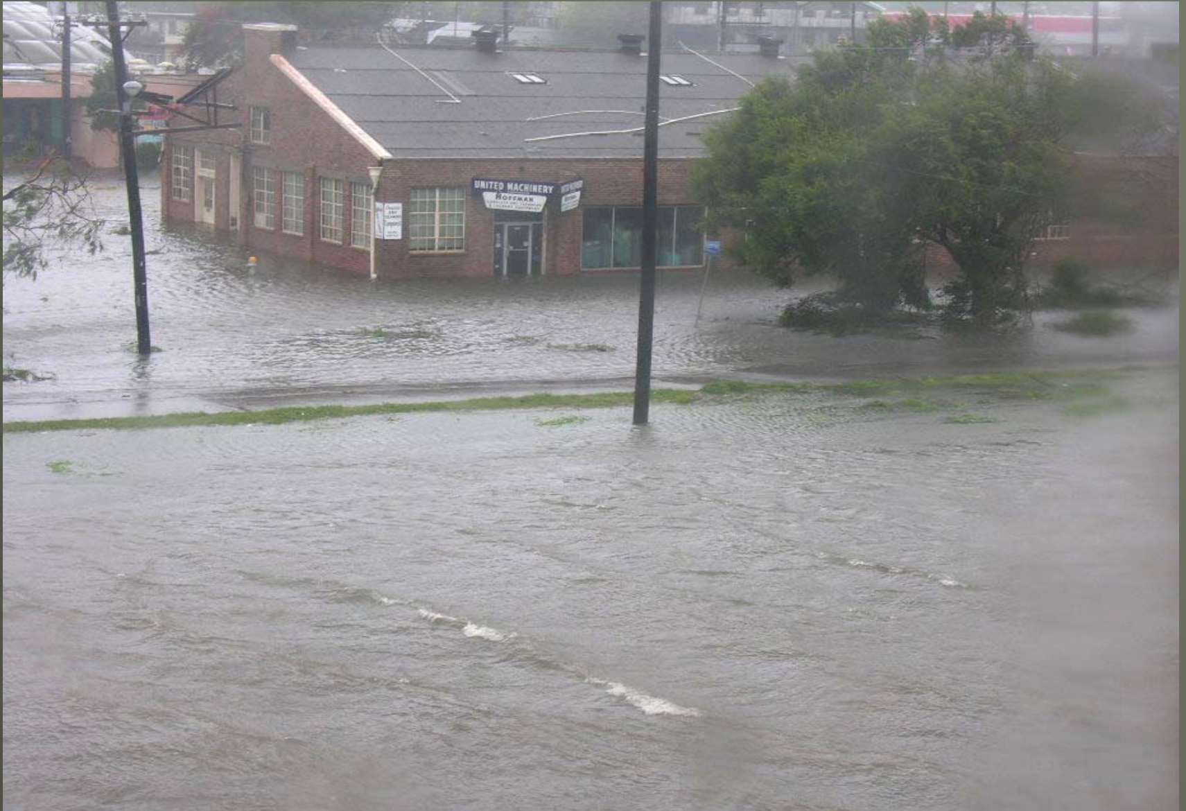
Washington Ave. Canal During Katrina