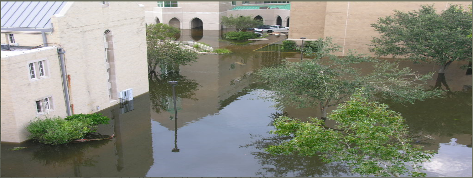
Music Building (Rear) During Katrina