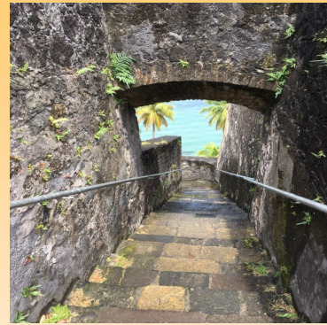
Port Au Prince, Martinique