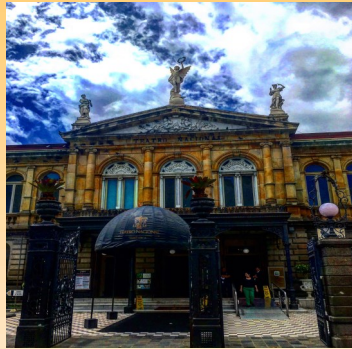
San Jose, Costa Rica